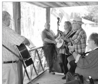
There is always good music and great times at Clenny Creek Day!