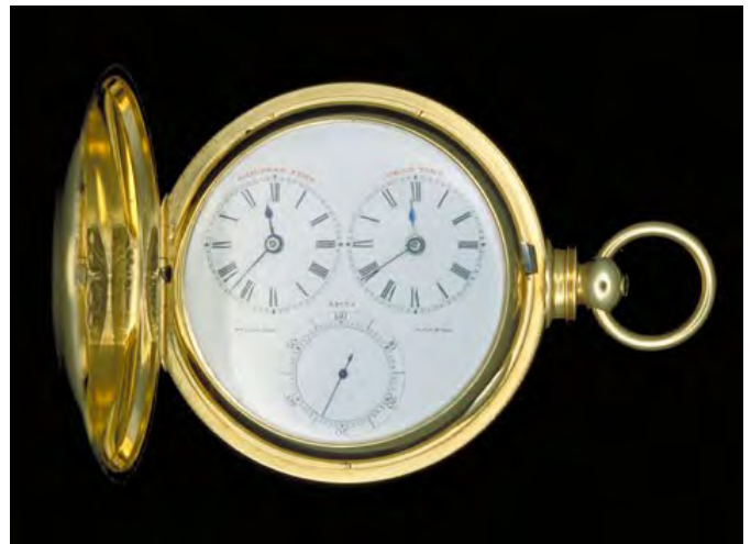
1850 Double Time Pocket Watch that could keep local time and railroad time simultaneously

In 1878, Canadian Sir Sandford Fleming proposed the system of worldwide time zones that we use today. He recommended that the world be divided into twenty-four time zones, each spaced 15 degrees of longitude apart. Since the earth rotates once every 24 hours and there are 360 degrees of longitude, each hour the earth rotates one-twenty-fourth of a circle or 15 degrees of longitude. Sir Fleming's time zones were heralded as a brilliant solution to a chaotic problem worldwide.