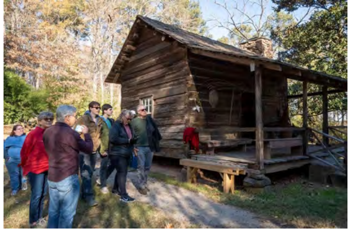
Part of the crowd at the McLendon cabin