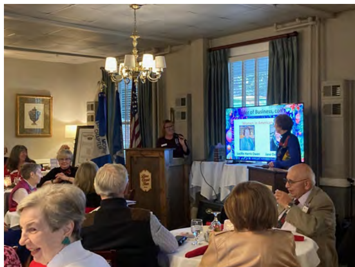
Combined meeting of two local chapters of the DAR