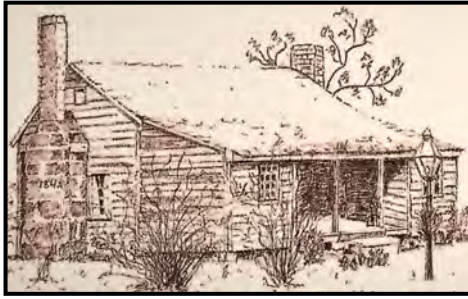
Shaw House, Garner House, Sanders Cabin & Tobacco Barn in Southern Pines