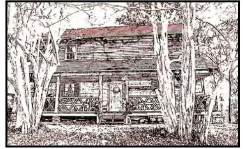
Bryant House and McLendon Cabin in Carthage