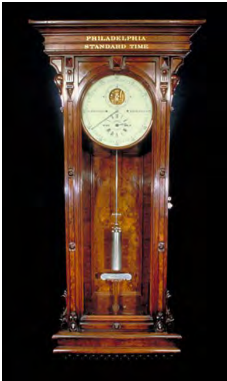
1874 Philadelphia Standard Time Regulator

Prior to the late nineteenth century, timekeeping was a purely local phenomenon. Each town would set their clocks to noon when the sun reached its zenith each day. A clockmaker or town clock would be the "official" time and the citizens would set their pocket watches and clocks to the time of the town. Enterprising citizens would offer their services as mobile clock setters, carrying a watch with the accurate time to adjust the clocks in customer's homes on a weekly basis. Travel between cities meant having to change one's pocket watch upon arrival.