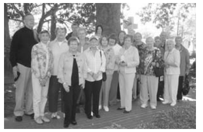
Palustris Festival, March 26