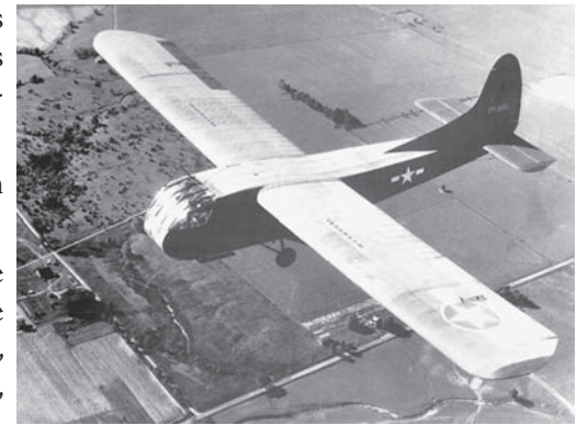
Gliders were often seen over Moore County and were used in the

The temporary buildings that housed the troops during the war were demolished soon mock-invasion of the Pinehurst/Southern Pines Airport. after the war ended, but in recent years have been replaced by a permanent installation near the airplane runways that feature three strips of more than 5000 feet each.