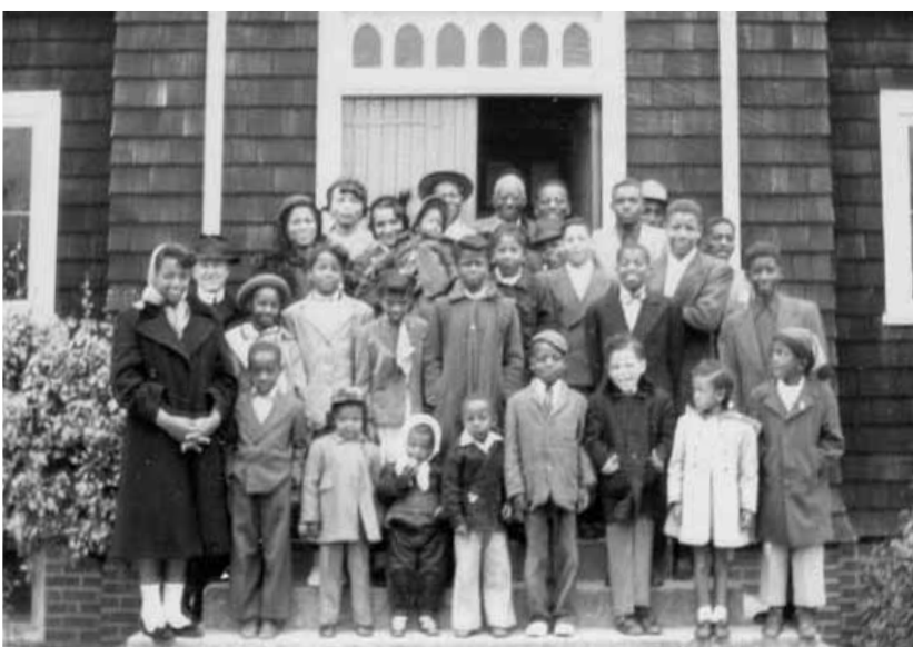
Our Lady of Victory Church. Pictured above is the church (left) and rectory (right). Photos show various church members and children in math class in 1953.