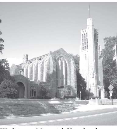
Washington Memorial Chapel and National Patriots Bell Tower.