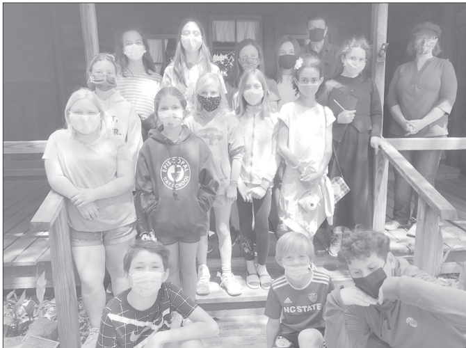
Students from the Episcopal Day School recently toured the Shaw House Property.