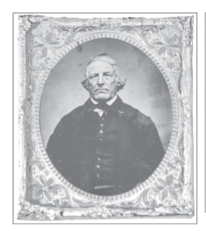
Ambrotype of Sam Wilson

James Flagg's image on WWI posters was the first appearance of Uncle Sam on a U.S. postage stamp when it was featured in the Celebrate the Century commemorative series in 1998. The 32-cent stamp from the set marked the decade of the 1910s and featured the caption "U.S. Enters World War I." Just a few months later, Uncle Sam appeared again, this time on a 22-cent stamp issued Nov. 9, 1998, to fulfill the upcoming change of the additional-ounce rate in January 1999. The First Day of Issue of the stamp was in Troy, NY, recognizing Sam Wilson as the progenitor of Uncle Sam.