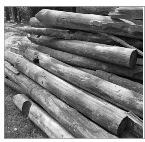
Some of the logs rescued and stacked at Bryant House